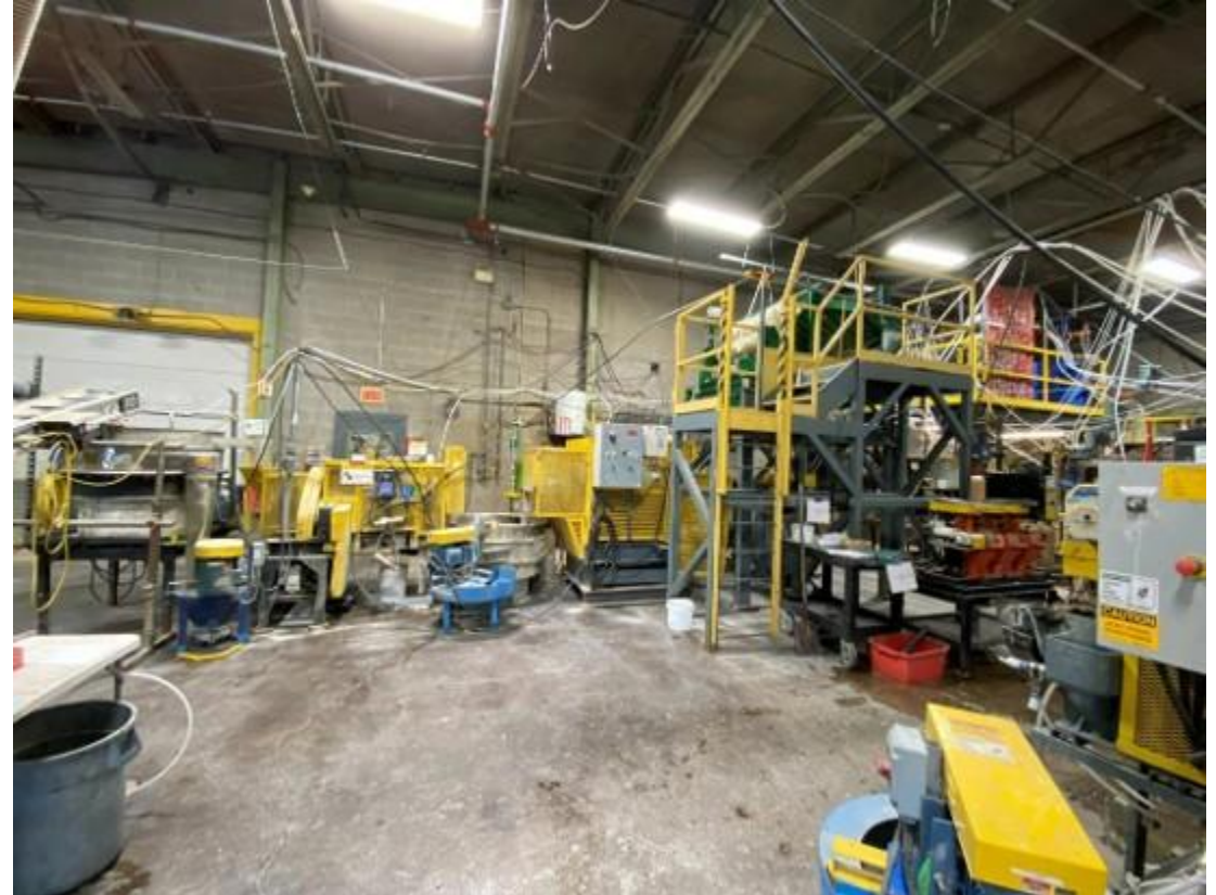
Beneficiation Pilot Plant at SGS Lakefield – May 2026