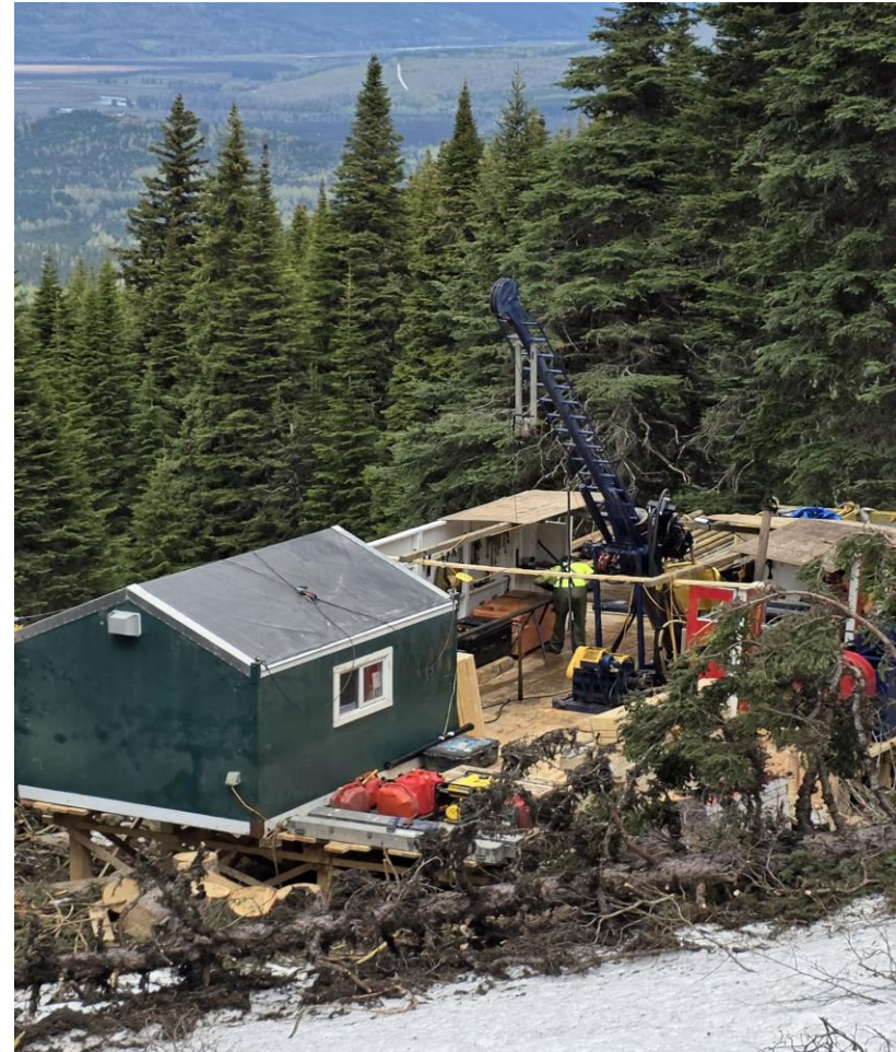
Diamond drill rig on deposit at Wicheeda – May 2026