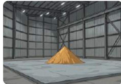
45% TREO grade in concentrate