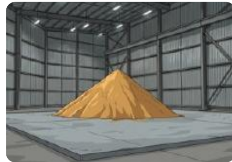
15% TREO grade in concentrate