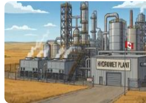
Hydromet 3x SIZE