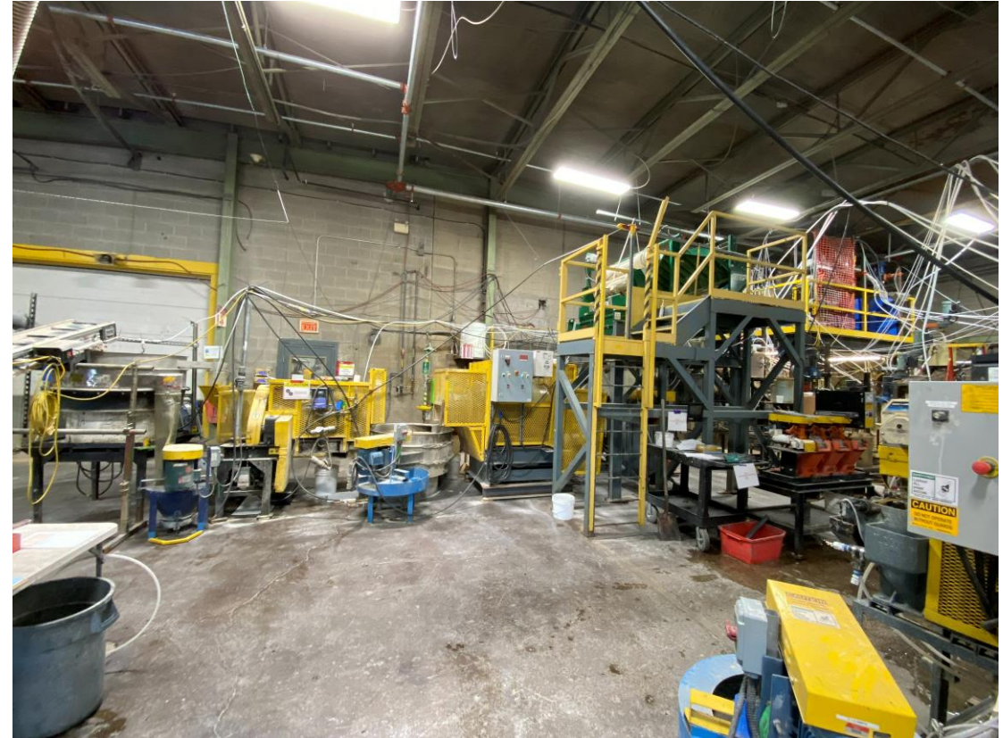
Beneficiation Pilot Plant at SGS Lakefield – May 2026