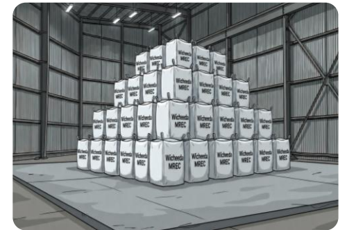
Same Output TREO