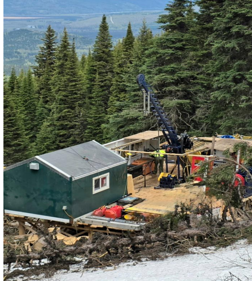
Diamond drill rig on deposit at Wicheeda – May 2026