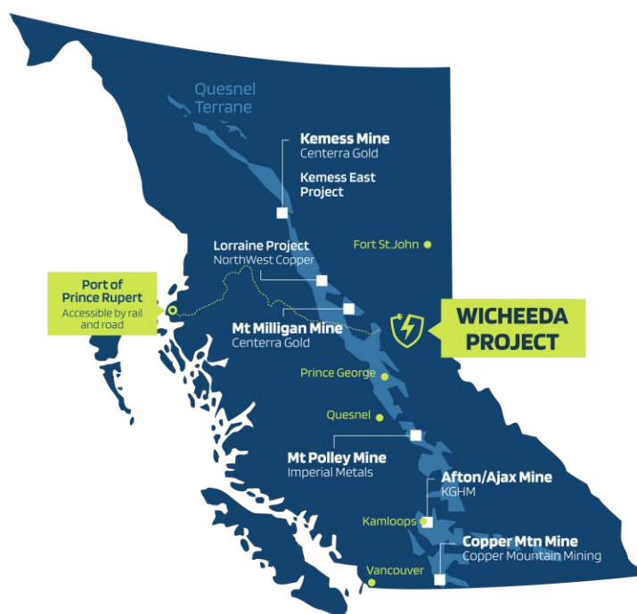
Figure 1: Wicheeda Project Location

The Wicheeda Project is 100% owned by Defense Metals and is 8,301-hectare (~20,534-acre) comprising 6 claims (1,708 hectares) acquired through completion of the Spectrum Mining Corporation ("Spectrum") option agreement (see below), in addition to Defense Metals staking an additional 7 claims (6,593 hectares) between the dates of November 5, 2021 and November 24, 2023.